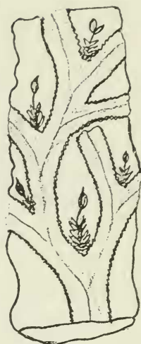
Growth of Z. lichenoides as an epiphyte on the buttresses of a Ficus tree.